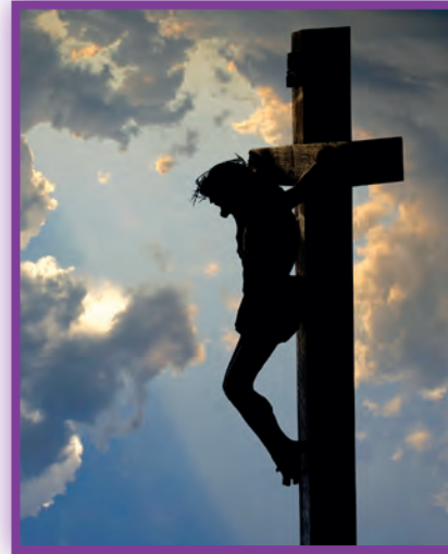
Jesus gave His life for us.