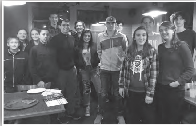
Students for Life met in December in Yakima for an organizational meeting.

Students for Life has five key "pillars" of activity: to create awareness of the abortion crisis and recruit students to help confront it; to systematically expose the abortion industry; lobby for the passage of pro-life legislation and opposition of pro-abortion legislation; identify and counter the abortion agenda; and provide resources and help to those