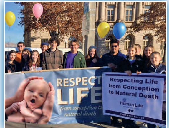
Students for Life gathered at Millennium Plaza following the Walk for Life in Yakima.