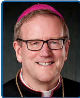
Bishop Robert Barron