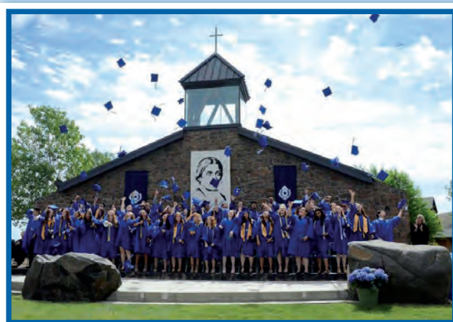
La Salle High School graduation, 2017.

These immersion trips range from travel to Seattle to work in homeless shelters and food kitchens; to a journey to the Blackfeet Reservation in Browning, Montana, to mentor young children and learn of the