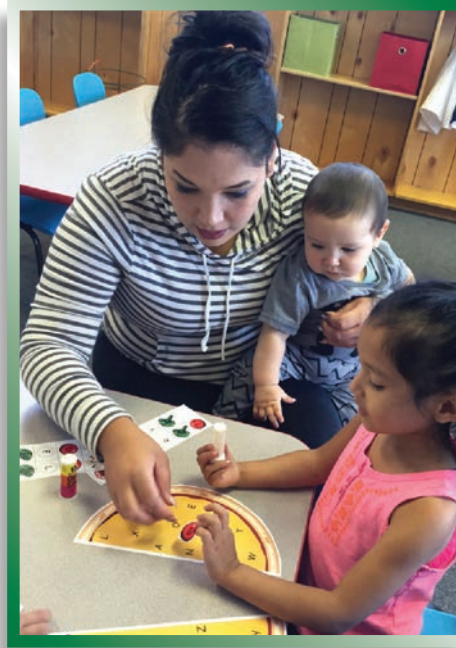
A young mother and her children enjoyed an activity at the Family Center.

Based in the Family Center at 811 West Vineyard Drive in Kennewick, an extension of St. Joseph Church, the programs serve pregnant women and families and caregivers with young children.