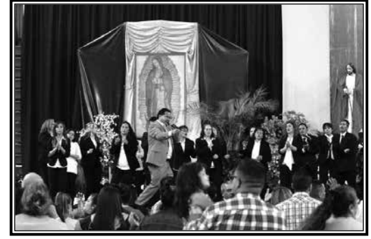
Many gathered for the 2014 Congress.