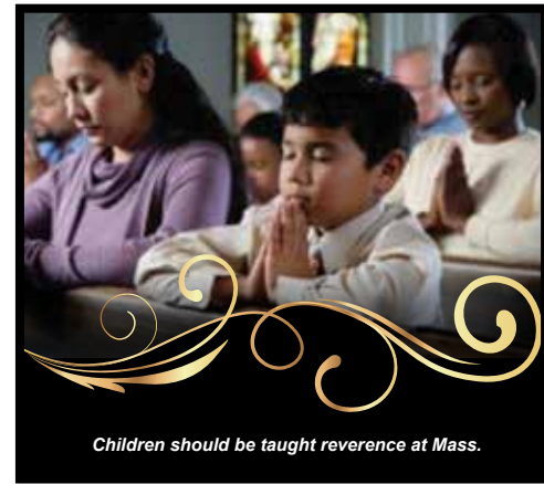
Children should be taught reverence at Mass.

The Year of Mercy will end November 20, the feast of Christ the King. Why not take advantage of this wonderful opportunity to obtain these special graces?